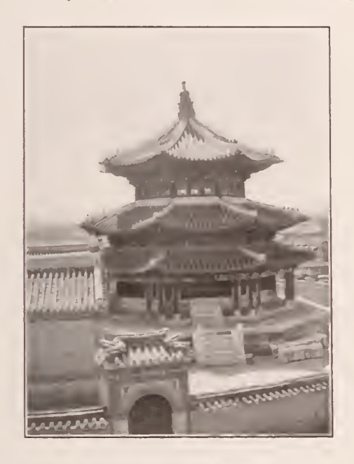
TEMPLE WHERE THE EMPEROR WORSHIPS.

rather under size, being about five feet three or four inches high. His face is handsome; when composed, the expression is somewhat inanimate, but when engaged in conversation it brightens into a kindly and pleasing smile. His voice is pleasant, well modulated, and he speaks